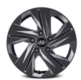
16" alloy wheel Standard on Preferred model