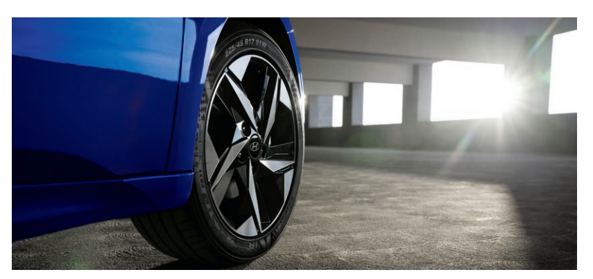
Available LED headlights Available 17" alloy wheels