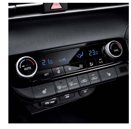
Standard heated front seats and available heated steering wheel Available dual-zone climate control