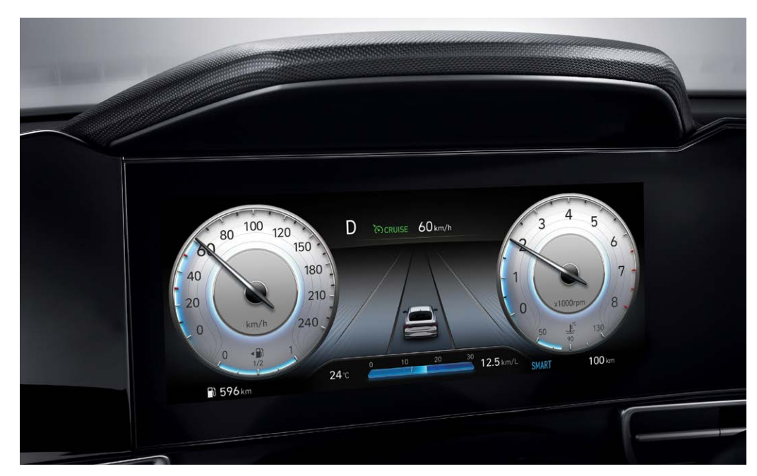
Available 10.25" full digital instrument cluster

Standard Apple CarPlay<sup>™</sup> and Android Auto<sup>™</sup> smartphone connectivity lets you access your favourite mobile apps — music, maps, messages and more — seamlessly and safely through voice commands and the touch-screen display. Essential, Preferred and Ultimate models feature convenient wireless connection, no cable required.