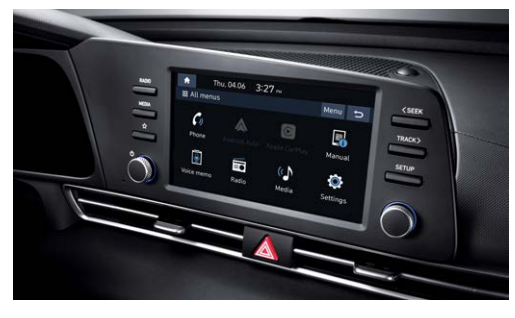
Available 10.25" touch-screen navigation display Standard 8.0" touch-screen display