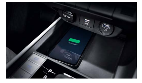
Available Bose® premium sound system Available wireless charging pad▼