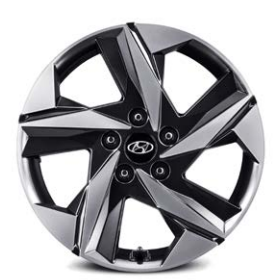
17" alloy wheel Standard on Ultimate model