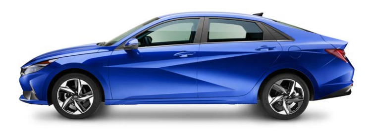
Three-dimensional "Parametric Dynamics" design lines

Our designers have a name for the bold stylings of the all-new Elantra — they call it "Parametric Dynamics." What that means for you is a striking grille that seamlessly integrates into the headlight architecture. Along the sides, distinctive lines converge, giving a unique, three-dimensional look. Rounding out the bold style are a sleek-edged trunk lid and connected tail light design, adding to the confident new appearance.