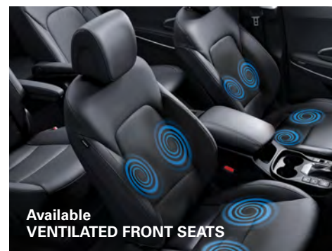
Available VENTILATED FRONT SEATS

Transform the comfortable interior into the ultimate cargo hauler with reclining second-row seats that split-fold 40/20/40* and slide forward* for flexible storage options, while third-row seats split-fold 50/50 to even further enhance cargo utility. The available Smart Power Liftgate will make it that much more convenient to load and unload your cargo.