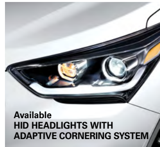
Available HID HEADLIGHTS WITH ADAPTIVE CORNERING SYSTEM