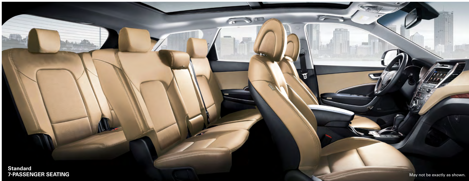
Standard 7-PASSENGER SEATING