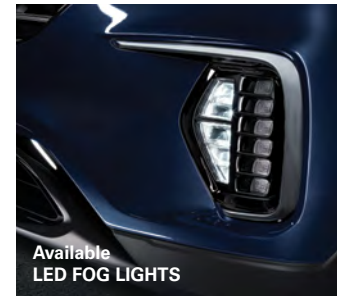
Available LED FOG LIGHTS