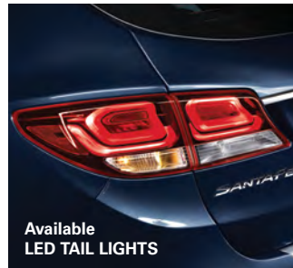
Available LED TAIL LIGHTS