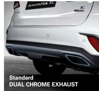
Standard DUAL CHROME EXHAUST