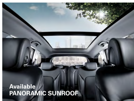
Available PANORAMIC SUNROOF