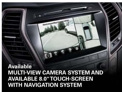
Available MULTI-VIEW CAMERA SYSTEM AND AVAILABLE 8.0" TOUCH-SCREEN WITH NAVIGATION SYSTEM