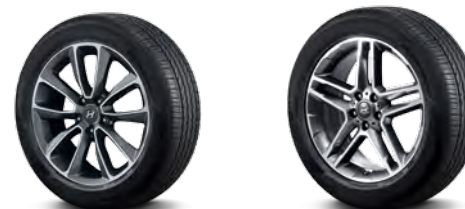
Standard 18" alloy wheel Available 19" alloy wheel

Choice of interior colour depends upon model and/or exterior colour selection. Due to the print production process, the colours shown throughout this brochure may vary slightly from the actual hue. Textures may not be exactly as shown. Visit hyundaicanada.com or see your dealer for details.