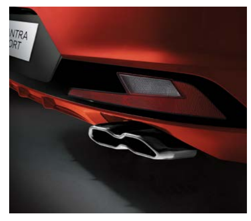
Standard chrome-tipped sport exhaust