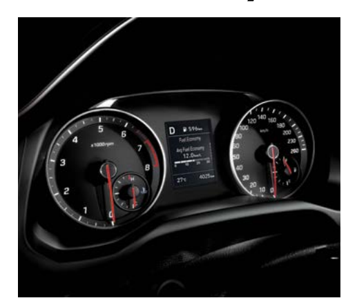
Standard sport instrument cluster