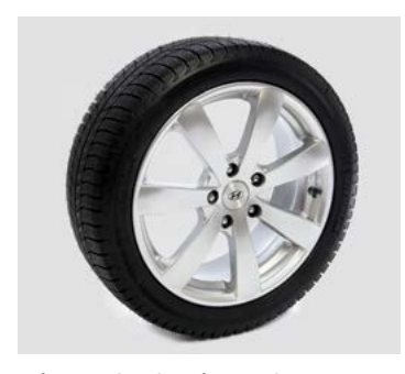
Winter Wheel & Tire Packages

Winter tires have specialized rubber and tread to handle the cold temperatures resulting in better traction, handling and braking. Mount your tires on a set of Hyundai steel wheels and spare your alloy wheels from the corrosion caused by salt and slush.