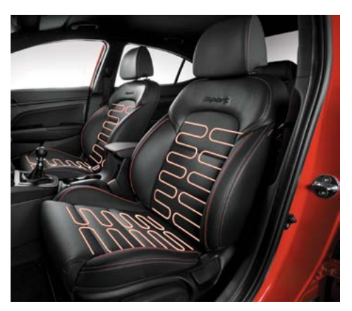
Standard leather heated front sports seats