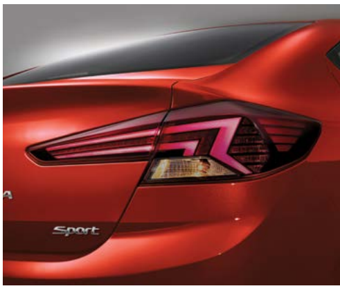
Standard LED tail lights