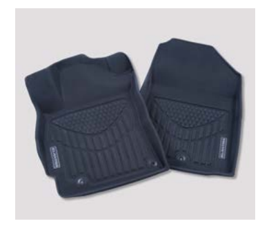
Premium All-Weather Floor Liners

Winter tires have specialized rubber and tread to handle the cold temperatures resulting in better traction, handling and braking. Mount your tires on a set of Hyundai steel wheels and spare your alloy wheels from the corrosion caused by salt and slush.