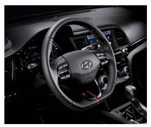
Standard sport D-cut heated steering wheel