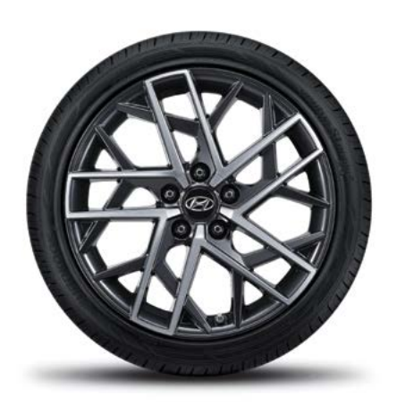
Standard 18" alloy wheel