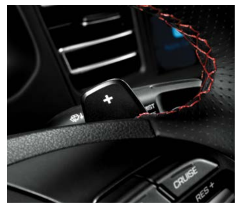
Available steering wheel-mounted paddle shifters