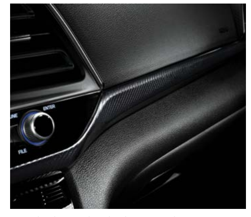
Standard sport-inspired accent trim