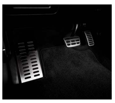
Standard aluminum sport pedals