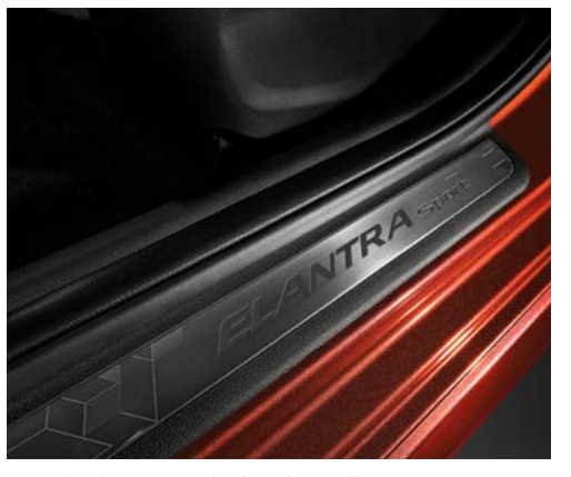
Standard sport exclusive door sills