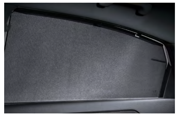
Available rear sunshade blinds