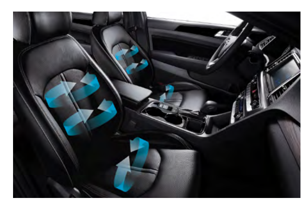
Available ventilated front seats