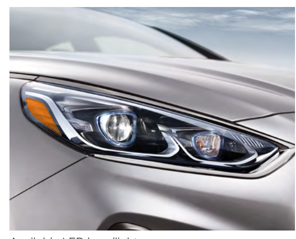
Available LED headlights

A unique cross-hatched design is available when you opt for the Essential model with available Sport Package or 2.0T Ultimate model. Sportier LED daytime running lights accent along the sides.