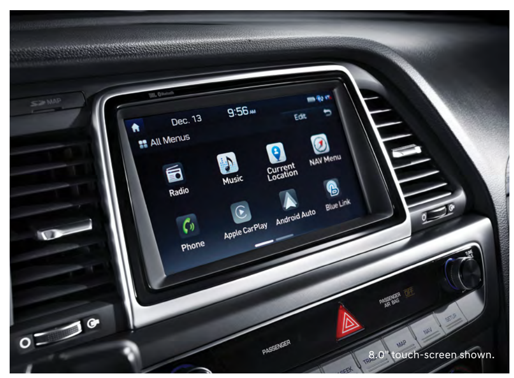
Apple CarPlay<sup>™∆</sup> and Android Auto<sup>™⋄</sup>

Standard Apple CarPlay™ and Android Auto™ let you interact with your favourite apps safely via the standard 7.0" touch-screen display. Once your compatible smartphone is connected, you can access apps to provide directions, use voice command to send text messages and stream your favourite music from your playlists.