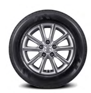
16" alloy wheel Standard on Essential model