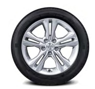
17" alloy wheel Standard on Essential model with Sport Package and Preferred and Luxury models