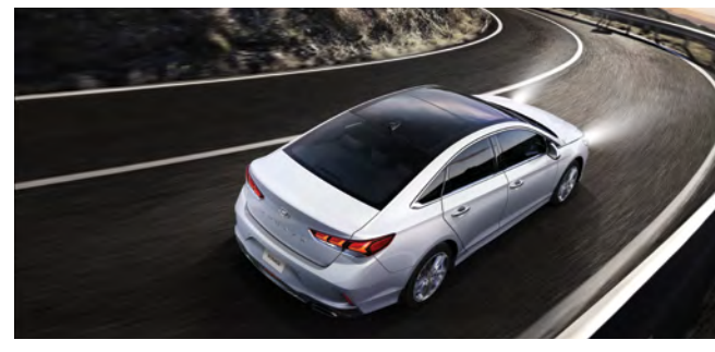
High Beam Assist

The standard Blind-Spot Collision Warning system lets you know if a vehicle is in your blind spot. Plus, our innovative system also senses the speed of the vehicle in the adjacent lane. If it's approaching faster than you can safely make the lane change, it will signal an alarm.