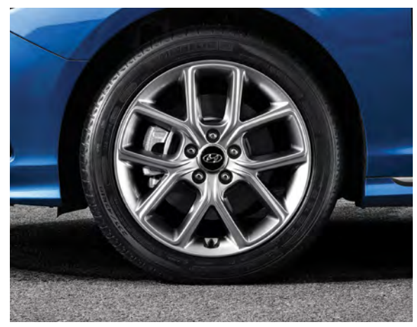
Available 18" alloy wheels.