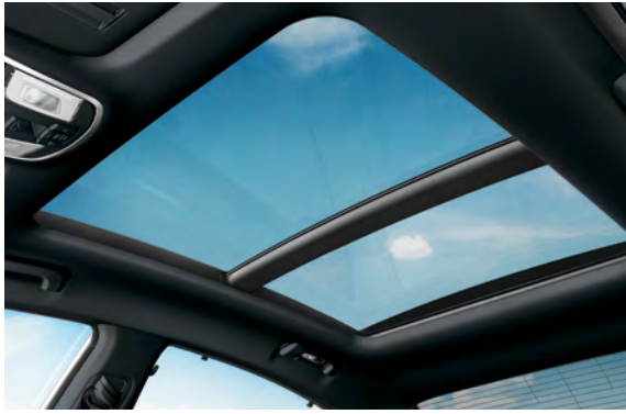
Available panoramic sunroof