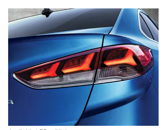
Available LED tail lights