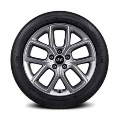
18" alloy wheel Standard on 2.0T Ultimate model