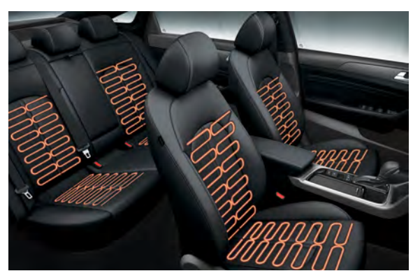
Standard heated front seats and available heated rear seats

The spacious cabin offers ultimate driver comfort with standard heated front seats, available ventilated front seats and an available Integrated Memory System that will memorize seating and side mirror preferences for two drivers. Rear-seat passengers will enjoy the available heated rear seats and sunshade blinds to help block the sun. And everyone can enjoy the view offered by the available panoramic sunroof.