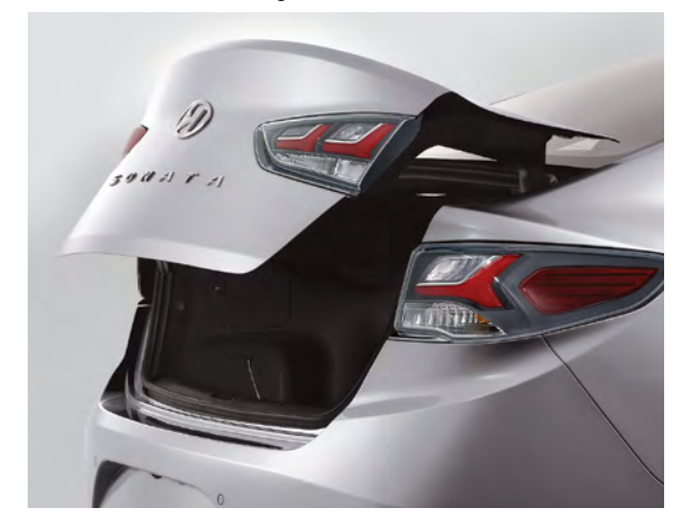
Available hands-free Smart Trunk