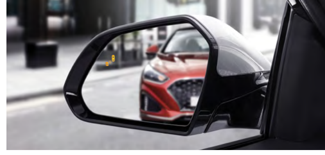
Blind-Spot Collision Warning with Lane Change Assist<sup>2</sup>

This safety feature uses a forward camera and radar sensors to detect rapidly closing speeds to the vehicle ahead or a pedestrian in your path. If a potential forward collision is detected, audible and visual warning notifications alert the driver. If the driver does not react to avoid the impact, the system can provide full braking assistance.