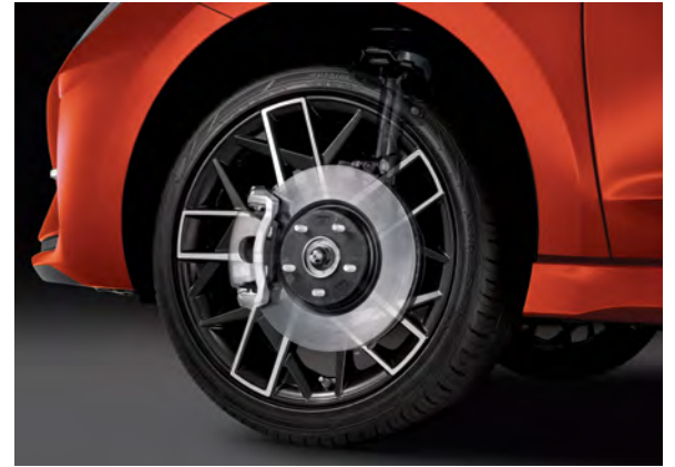
Standard 4-wheel disc brakes

Sink into the heavily bolstered leather front seats and wrap your hands around the sporty D-cut steering wheel to take control. Both are heated for added comfort on cold winter days. Further enhancing the cabin design are unique sport-inspired accents along the front dash, a black headliner, black trim details along the shifter and contrasting red accents throughout.