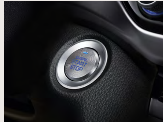
Standard proximity keyless entry with push-button ignition