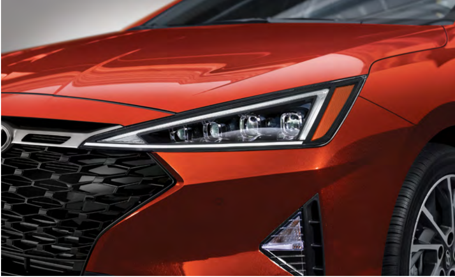
Standard LED headlights

The unique front-end design sets the tone with sharp body lines that frame an aggressive black-and-chrome front grille. From behind, your gaze will be fixed on the chrome twin-tipped exhaust outlet and diffuser that seamlessly integrate into the rear bumper.