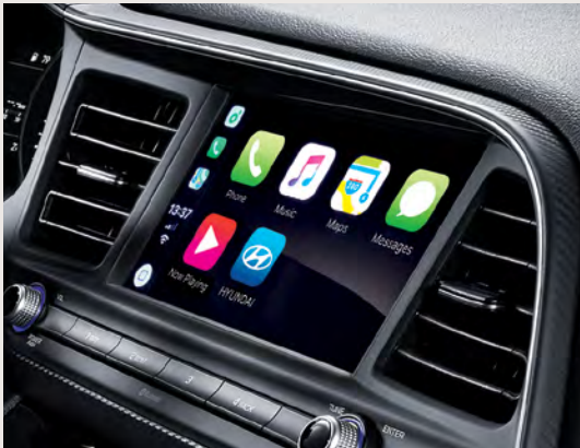
Standard 7.0" touch-screen display with Apple CarPlay™ and Android Auto™

Looking for features that keep you connected? Standard Apple CarPlay™ and Android Auto™ make accessing your favourite apps, like navigation, music and so much more, extremely convenient with the intuitive 7.0" touch-screen display.