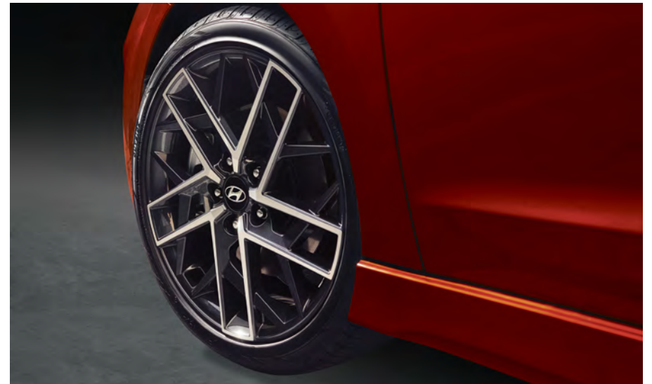
Standard 18" alloy wheels