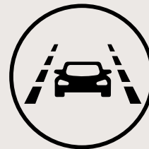
Lane Departure Warning with Lane Keeping Assist