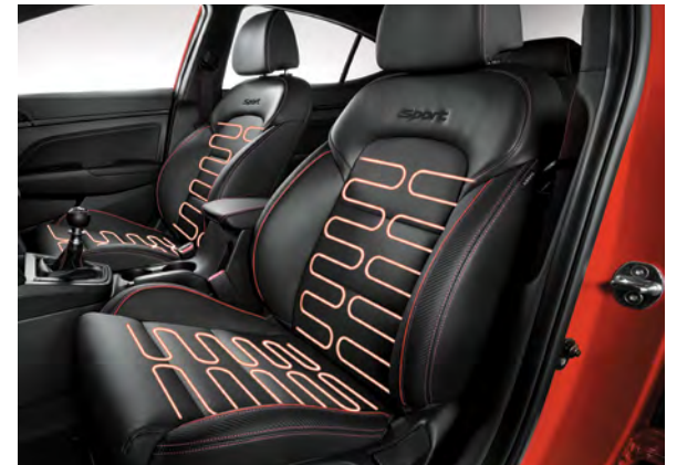
Standard heated front seats