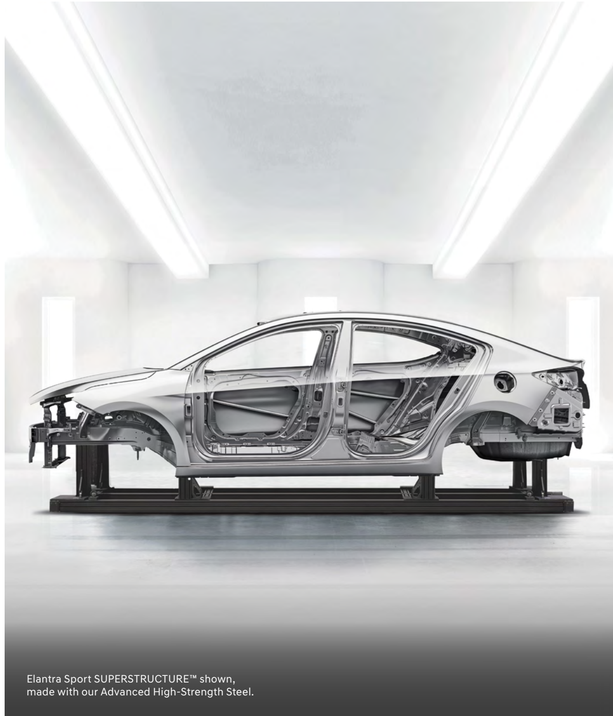
Elantra Sport SUPERSTRUCTURE™ shown, made with our Advanced High-Strength Steel.

We test our vehicles in areas like the Arctic, our proving grounds in the Mojave Desert and on Germany’s world-famous Nürburgring circuit to deliver the durability and reliability you demand. And not only do we package our vehicles with advanced safety and technology, we back all our vehicles with one of the best automotive warranties in the industry. This means you really can have it all, quality and value together.