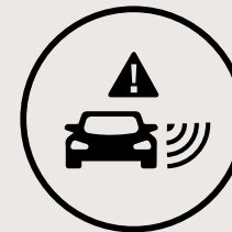
Blind-Spot Collision Warning