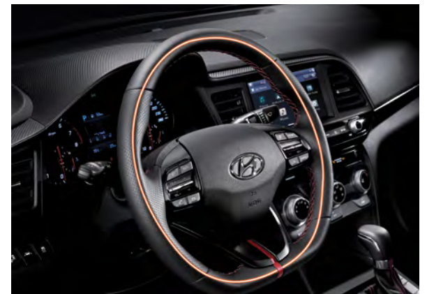
Standard D-cut heated steering wheel