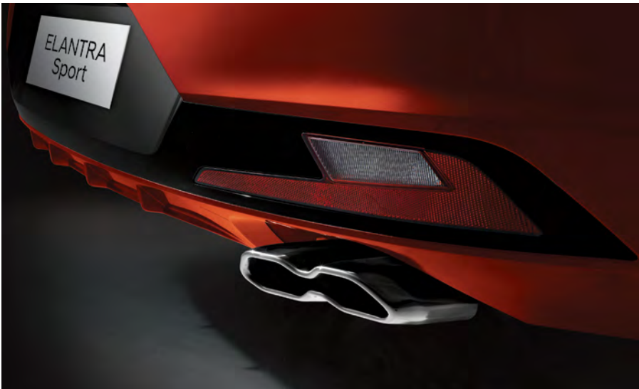
Standard chrome twin-tipped exhaust outlet