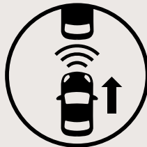
Forward Collision-Avoidance Assist

Surround yourself with a standard suite of Hyundai SmartSense™ safety features. Advanced technologies designed to help alert you to, and even avoid, unexpected dangers on the road.