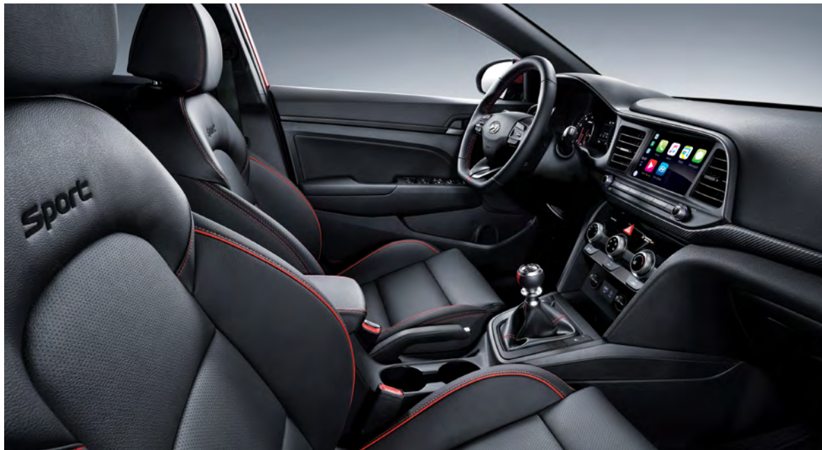
Standard leather sport seats with red stitching