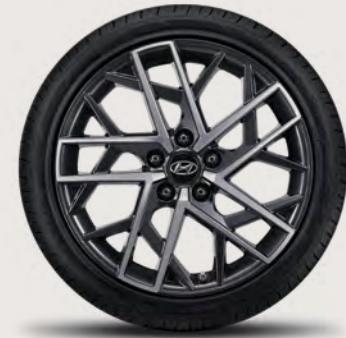
Standard 18" alloy wheel