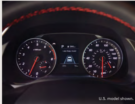
Standard sport instrument cluster