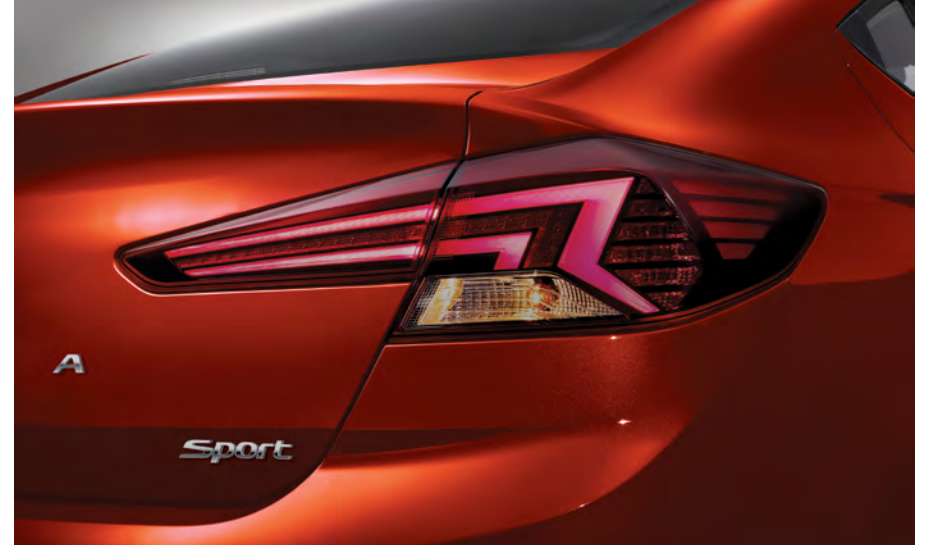
Standard LED tail lights