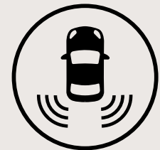
Rear Cross-Traffic Collision Warning