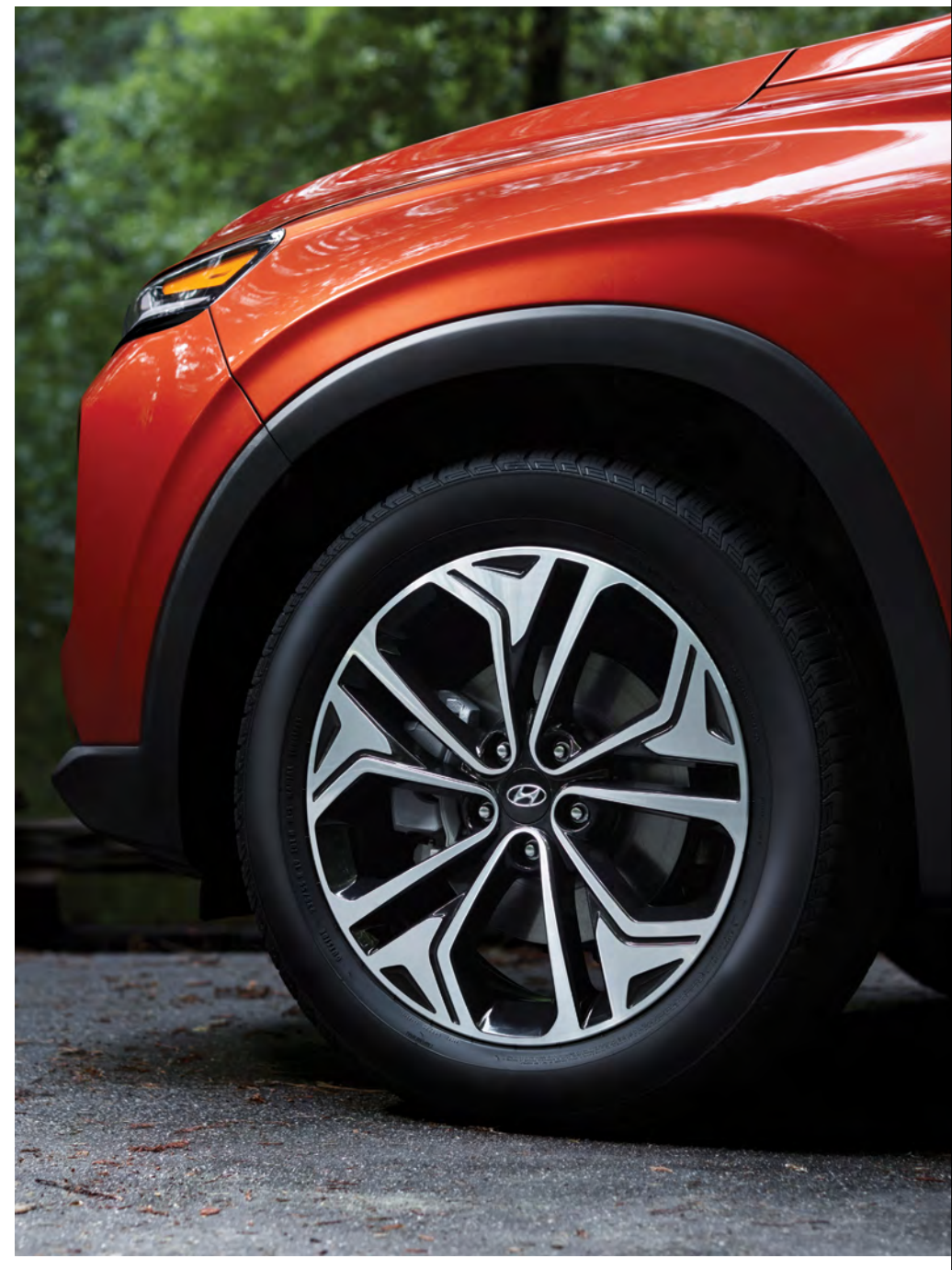
Available 19" alloy wheels

The cascading grille is framed by a unique twin headlamp design, comprised of LED daytime running lights positioned above the available LED headlights. The bold design is characterized by a sleek roofline and dynamic side character line running from the headlights to tail lights. Available 19" alloy wheels further enhance its commanding presence on the road.