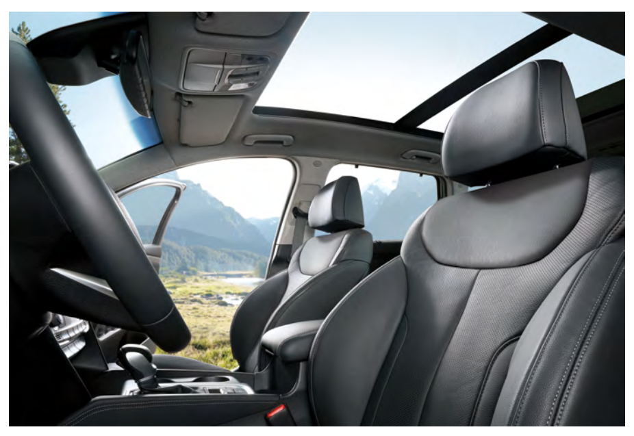
Available panoramic sunroof with premium headliner