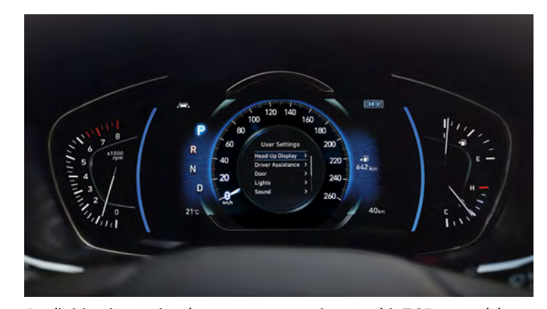
Available electro-luminescent gauge cluster with 7.0" supervision LCD trip computer