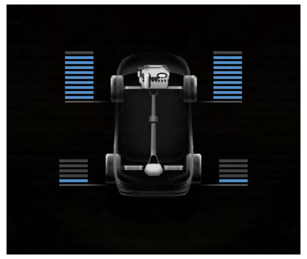
SMART: Fuel conservation, provides improved fuel efficiency by sending power mainly to the front wheels.