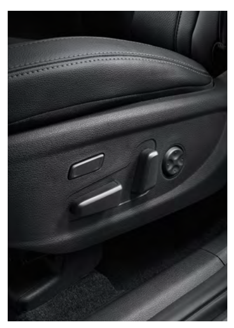
Available 12-way power driver's seat with power thigh extension