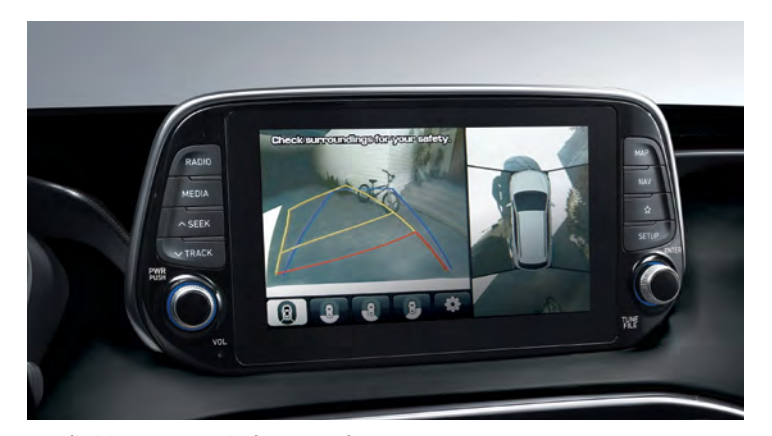
Available Surround View Monitor