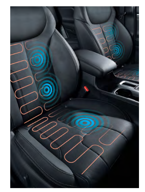
Standard heated front seats and steering wheel, available ventilated front seats

The Santa Fe provides generous head, leg and shoulder room so everyone can travel in comfort. The spacious cabin feels even larger when the available panoramic sunroof spans open on a beautiful summer day. Now choose your preferred temperature with available dual-zone control for both driver and front passenger, customize driver seating with the available 12-way power driver's seats and take command of the road in the luxurious Santa Fe.