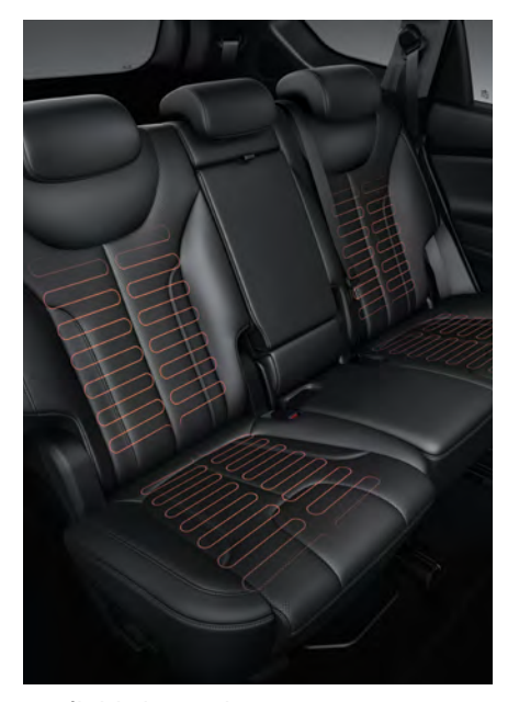
Available heated rear seats