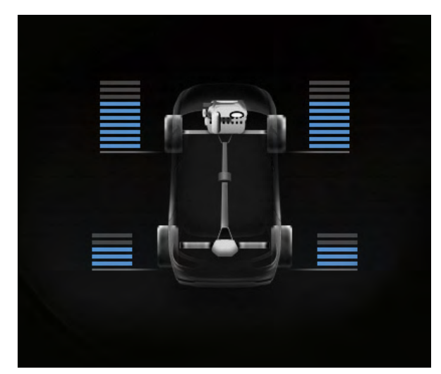
COMFORT: Balanced, helps provide further driver confidence and stable control in all weather conditions.

This system maximizes driving pleasure and makes performance accessible in even the most demanding conditions. What separates HTRAC™ from competing AWD systems is the ability to choose the traction distribution with HTRAC™ Intelligent Drive Modes. Each mode alters transmission mapping, power distribution, throttle responsiveness and stability control settings. In slippery conditions, the system distributes power to all four wheels automatically.