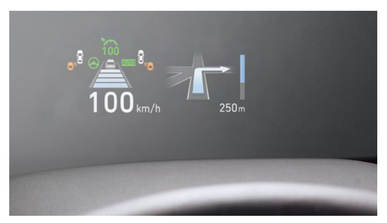
Available Head-Up Display

best offered with our available BlueLink® connected vehicle system is the convenience of starting your vehicle remotely from your smartphone. Please see your dealer for full service-level details.