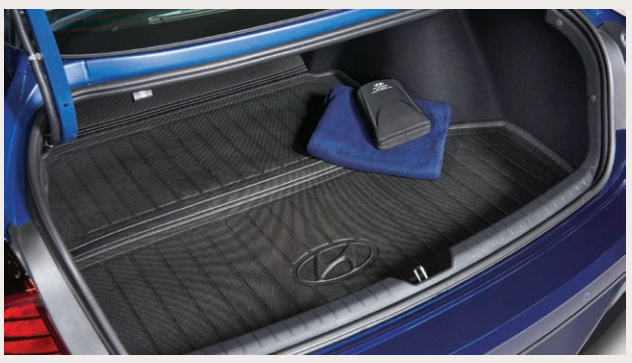
Premium all-weather cargo tray

Premium all-weather floor liners were designed to cover the interior carpet providing maximum protection against the elements that other mats cannot offer. Their unique and durable design features a non-slip surface for added comfort and a long-lasting premium look. Remove carpet mats prior to installation.