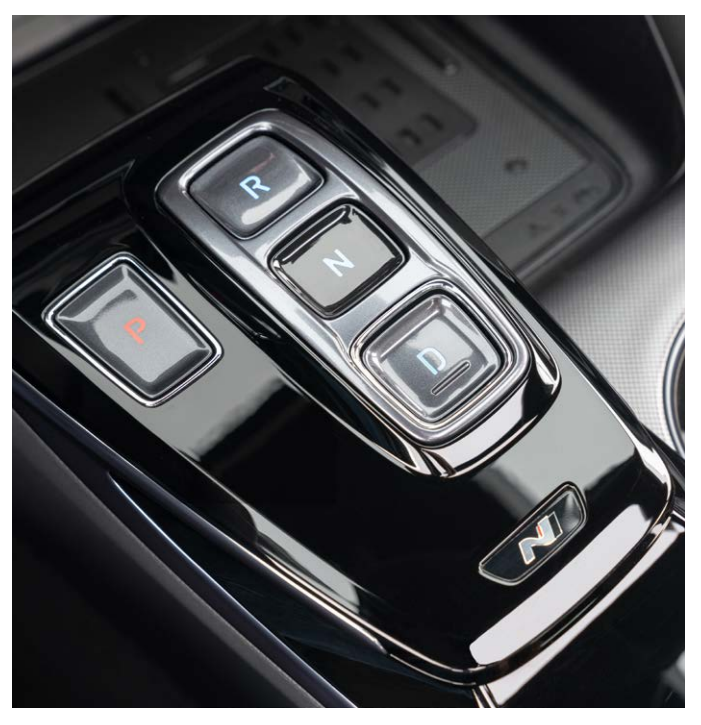
N 8-speed Wet Dual Clutch Transmission (N DCT) with paddle shifters

The Sonata N Line is outfitted with a Sport-tuned suspension designed to elevate on-road dynamics, responsiveness and feel.