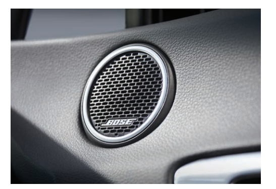
Head-Up Display Bose® premium audio with 12 speakers

Make the most of your drive with seamless connectivity offered by Apple CarPlay<sup>™∆</sup> and Android Auto<sup>™₀</sup>. The high-definition 10.25" touch-screen display offers intuitive smartphone mirroring to access your favourite apps, like Spotify<sup>®</sup>, which will sound incredible on the Bose<sup>®</sup> premium sound system.