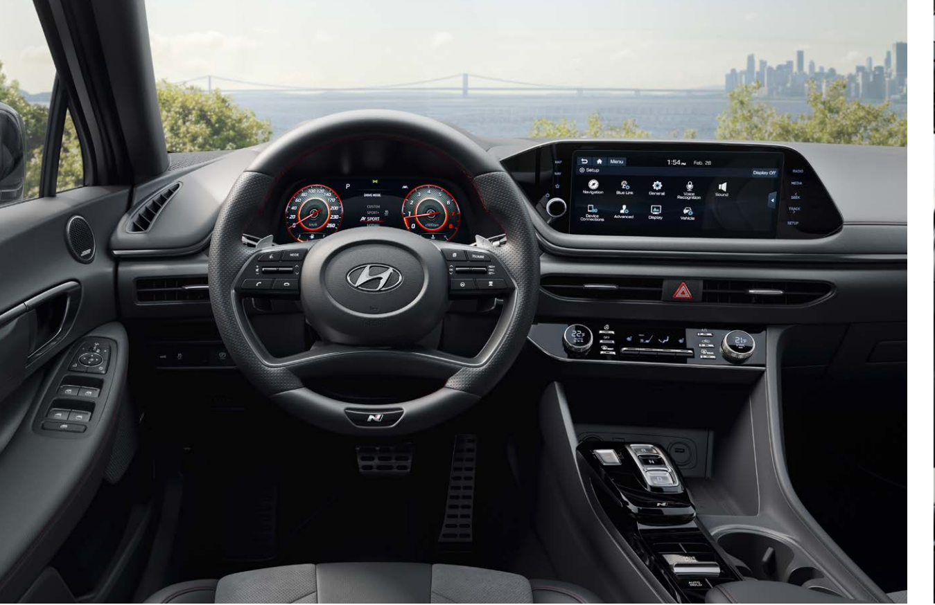
N Line leather-wrapped steering wheel with red stitching and emblem

Inside the very modern and spacious cabin you'll find a number of N-inspired features, such as Nappa leather and suede Sport seats with red stitching and piping details. The N logo stamped on the steering wheel and shift-by-wire controls infuse the interior with the feeling of the N brand.