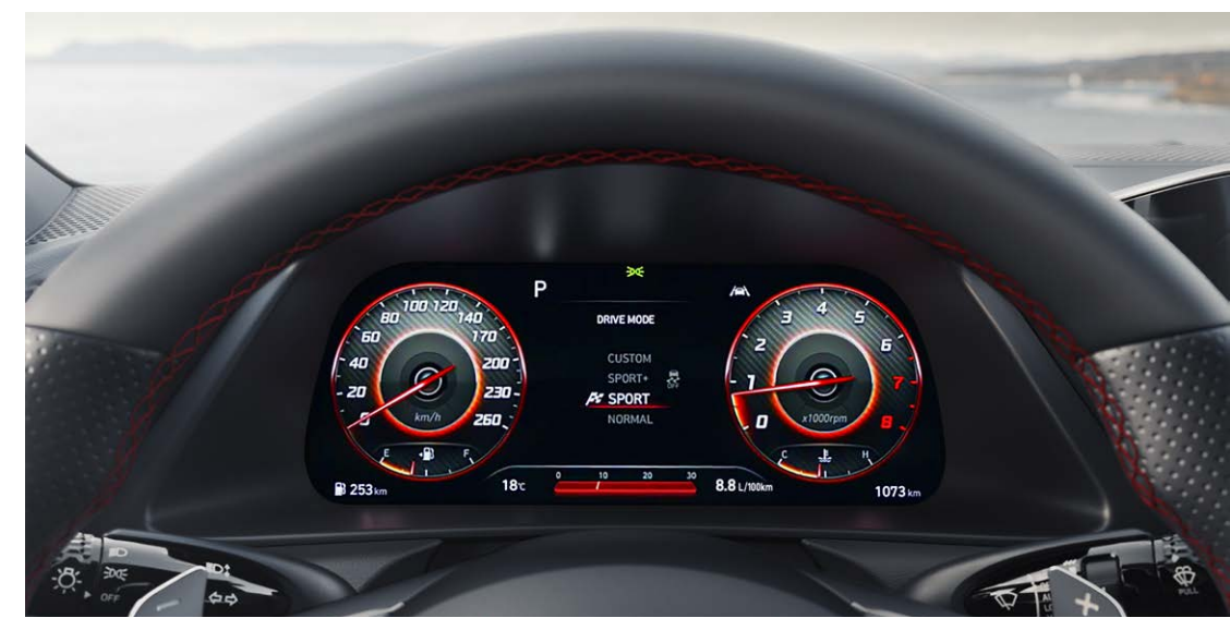
12.3" full digital instrument cluster