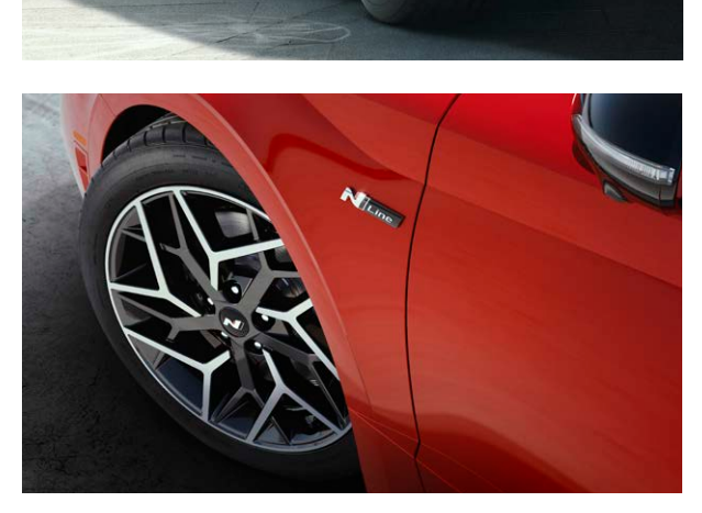
N Line side skirt N Line 19" alloy wheels