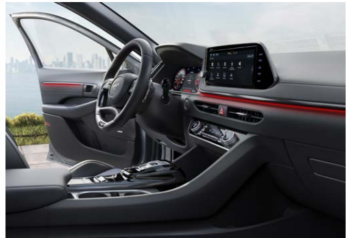
10.25" touch-screen with navigation system Interior ambient lighting