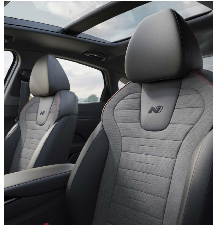
N Line Nappa leather and suede Sport seats Driver's power-adjustable side bolsters