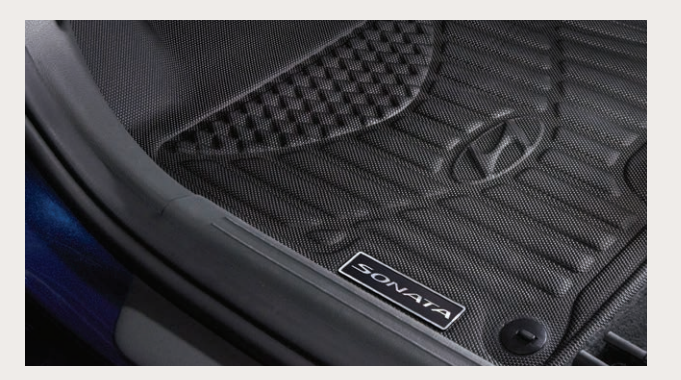
Premium all-weather floor liners

Premium all-weather floor liners were designed to cover the interior carpet providing maximum protection against the elements that other mats cannot offer. Their unique and durable design features a non-slip surface for added comfort and a long-lasting premium look. Remove carpet mats prior to installation.