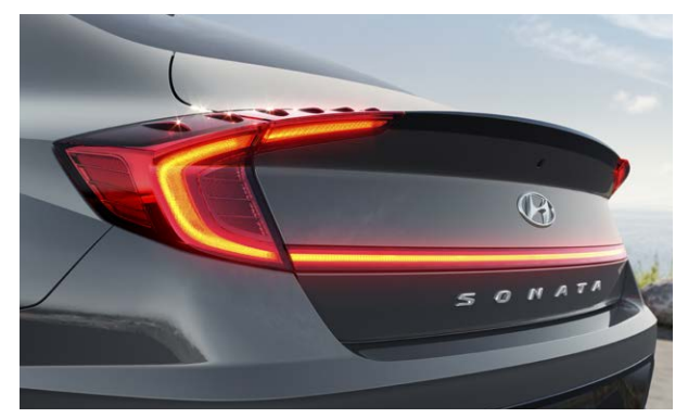
N Line rear fascia with rear diffuser and dual twin-tip exhaust outlets N Line rear spoiler