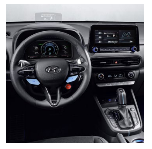
N leather-wrapped sport steering wheel with paddle shifters and N Grin Shift and N Mode buttons with N gear shift knob