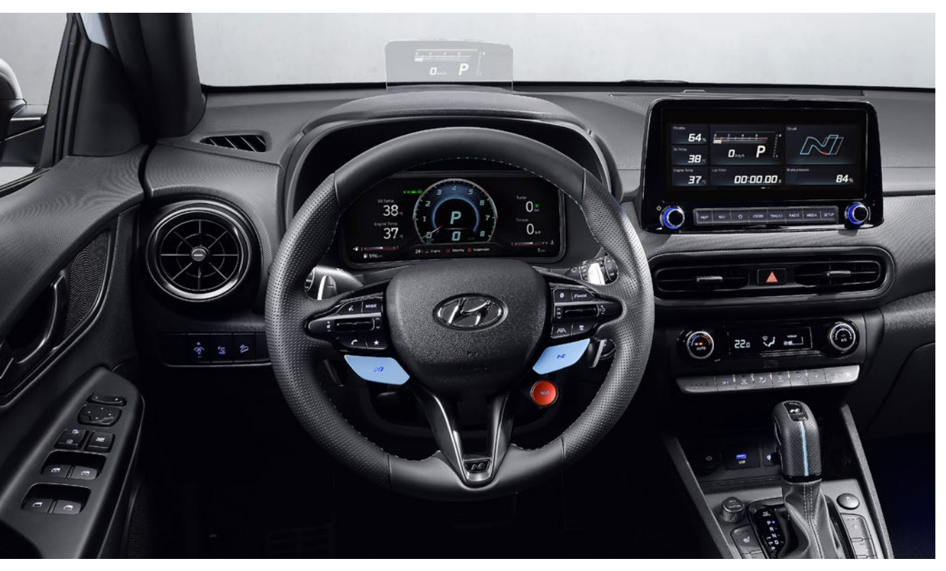
Dual 10.25" widescreen navigation and digital cluster display Head-up display with N graphics

And stay connected to your vehicle and the world with Bluelink® and a three-month trial of SiriusXM™ satellite radio.