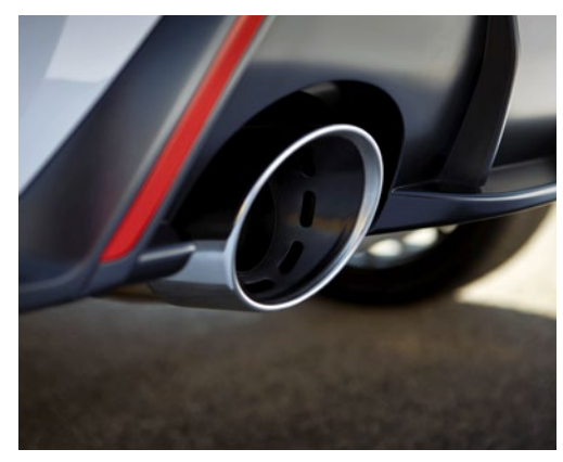
Dual large-bore exhaust outlets