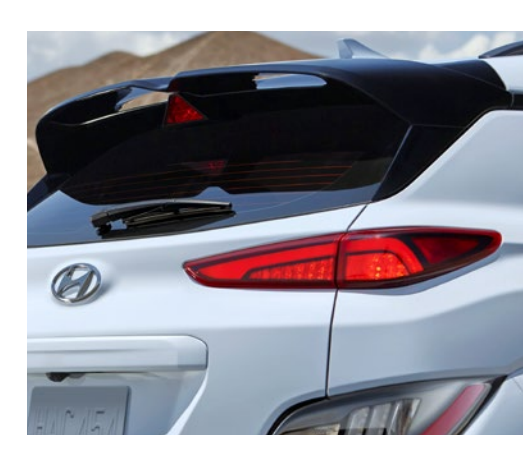
N double wing-loop spoiler