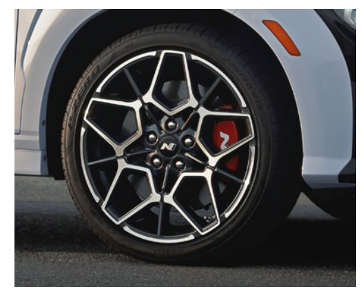
N-exclusive 19" alloy wheels with Pirelli™ high-performance summer tires