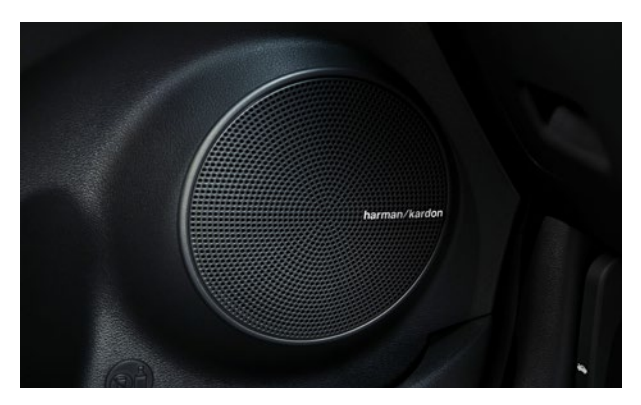
harman/kardon® premium audio with 8 speakers