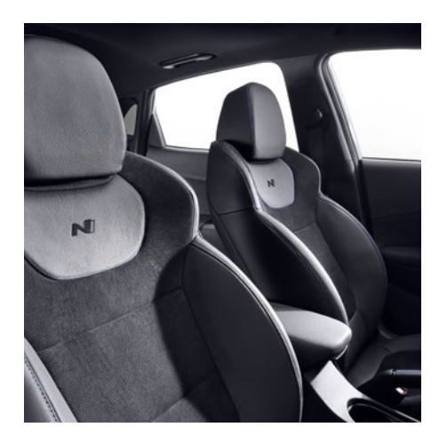
N sport leather/suede combination seats

The KONA N surrounds its driver in complete comfort, style and safety, including heated front seats and steering wheel, head-up display, distinctive aluminum N door scuffs and high-performance seating surfaces designed for improved passenger stability during racetrack driving.