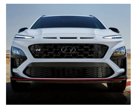
N front fascia with unique red front accents* N front mesh grille with N emblem

The KONA N is our first high-performance SUV. From its race car-inspired lowered front fascia with eye-catching red accents* to its N-exclusive 19" alloy wheels with high-performance Pirelli™ summer tires, to its distinctive N red-painted brake calipers, to its wing-type rear spoiler and N rear bumper and diffuser, everything about the outside of the KONA N shouts performance.