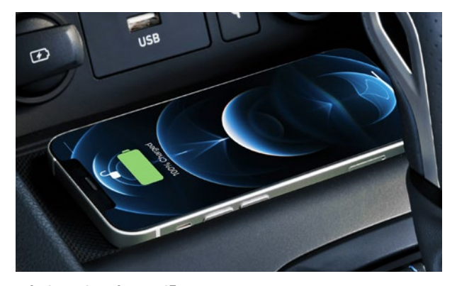
Wireless charging pad ▼