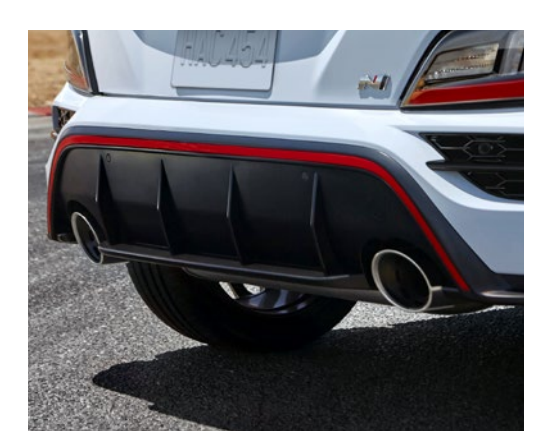
N rear bumper and diffuser