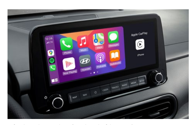
Wired Apple CarPlay<sup>™∆</sup> and Android Auto<sup>™⋄</sup> Bluelink<sup>®</sup> and SiriusXM<sup>™</sup>