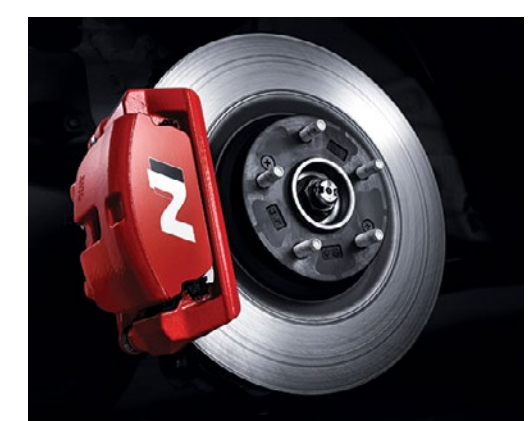
N red-painted brake calipers