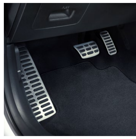
Alloy sport pedals