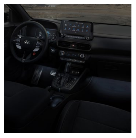
Interior ambient lighting, cup holder and foot well areas