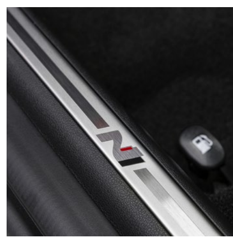
Aluminum N door scuff