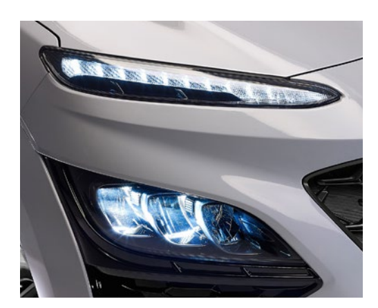
LED projection-type headlights (low and high)