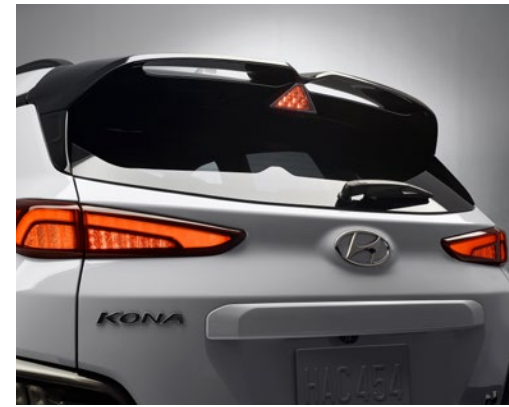
Full LED tail lights