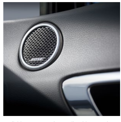
Available Bose® premium audio with 12 speakers