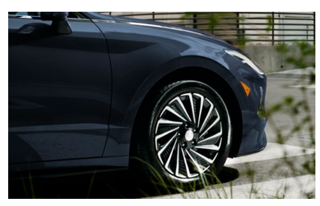
Available 17" aero alloy wheels