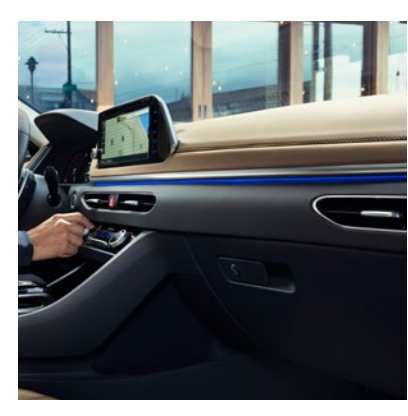
Available interior ambient lighting (64 colour choices)