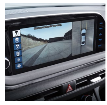
Standard 10.25" touch-screen display with navigation system and available surround

Step inside and access standard personalized profile settings for up to three drivers for ultimate convenience. The technology will keep settings for the driver's seat and side mirror positions, multimedia, drive mode, head-up display settings and more, all stored and accessible at the press of a button.