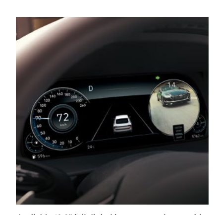
Available 12.3" full digital instrument cluster with Blind View Monitor