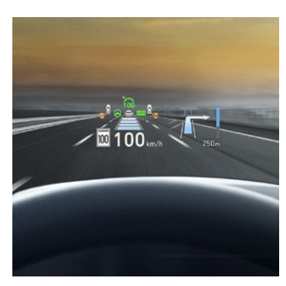
Available head-up display