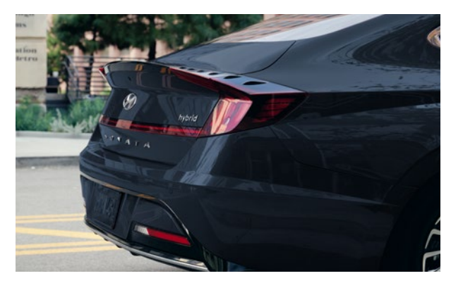
Available premium full LED tail lights