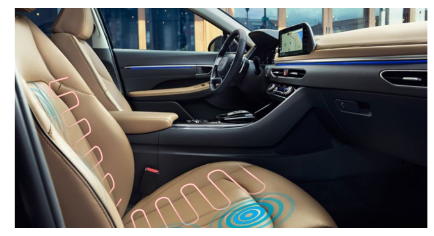
Standard heated front seats and available ventilated front seats

Sink into the available plush leather seats and stretch out in the spacious cabin. Heated front seats and a leather-wrapped heated steering wheel help you embrace Canadian winters, and once temperatures warm up, go from the comfort of heat to the cool satisfaction of ventilated front seats, all while soaking in the sunshine with the available panoramic sunroof that spans above the cabin. Pair this with the automatic climate control with three levels of airflow intensity and the cabin really will be your oasis.