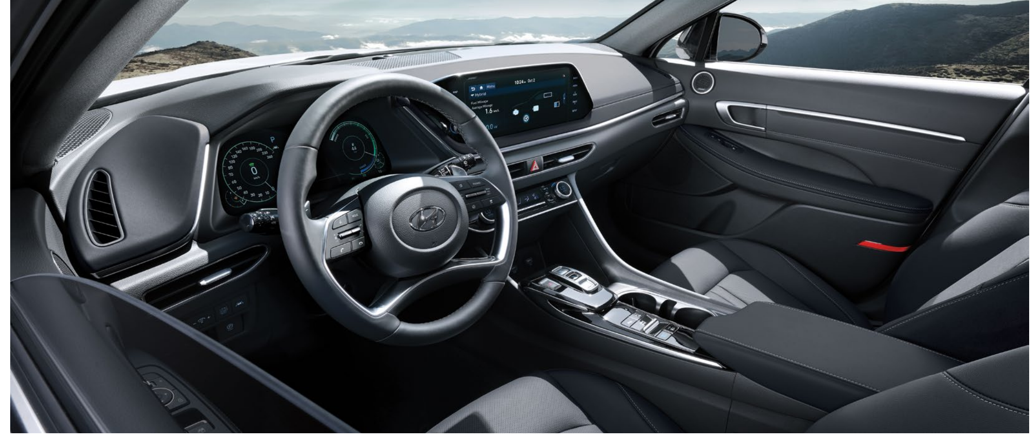
Ultimate Hybrid model shown.