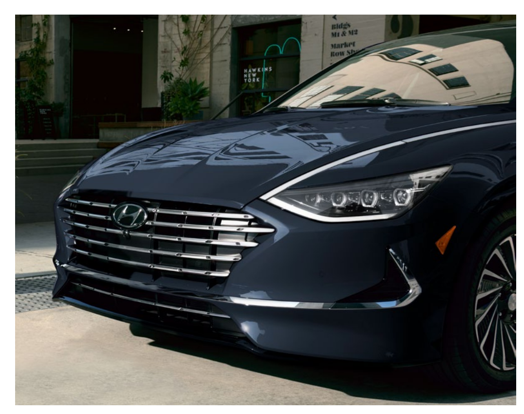
Standard hidden LED daytime running lights Available premium projector LED headlights

Our engineers created an unmistakable lighting signature unique to the SONATA that incorporates the very latest in lighting technology. Formed to the SONATA's body, the hidden LED daytime running lights appear chrome when turned off, and then dramatically brighten when turned on. The wide, horizontal LED tail lights at the rear connect to the brake lights on each side, creating a striking visual design at night.