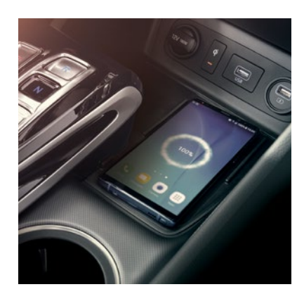
Available wireless charging pad ♥